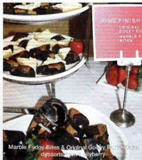
Marble Fudgy-Bites & Original Goopy Butter Cakes, desserts from Hollyberry